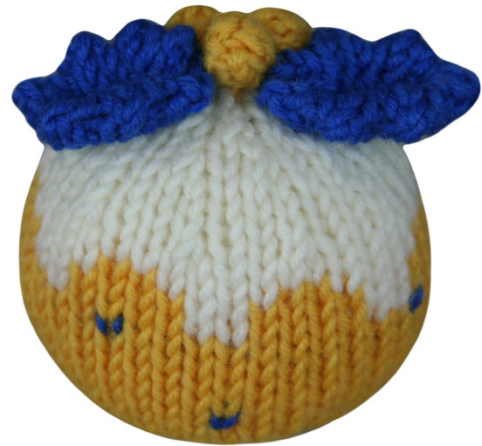
Height approximately 7cm

Work a gathering thread through the cast on stitches at the base, pull up tightly and join the seam from the bottom of the pudding to about a third of the way up. Then working down from the gathered top, join the seam, leaving an opening of approximately 3cm. Fill the pudding with small amounts of stuffing at a time, then close the seam.