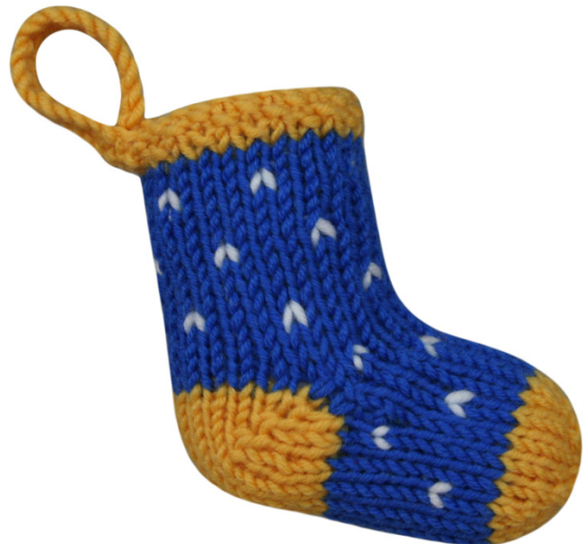
Height approximately 11cm

Row 36 (K1, K2tog, K1) 4 times (12 sts) B&T