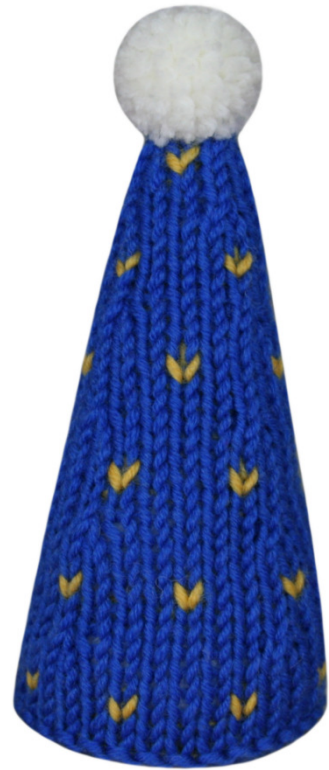
Height approximately 11cm

Work a gathering thread through the cast on stitches at the base, pull up tightly and join the seam from the bottom of the tree to about a third of the way up. Cut a circle out of cardboard approximately 4cm in diameter and place this at the base. Working down from the gathered top of the tree, join the seam, leaving an opening of approximately 3cm. Stuff the tree, shaping as you go, then close the seam.