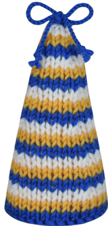
Height approximately 11cm

Work a gathering thread through the cast on stitches at the base, pull up tightly and join the seam from the bottom of the tree to about a third of the way up. Cut a circle out of cardboard approximately 4cm in diameter and place this at the base. Working down from the gathered top of the tree, join the seam, leaving an opening of approximately 3cm. Stuff the tree, shaping as you go, then close the seam.