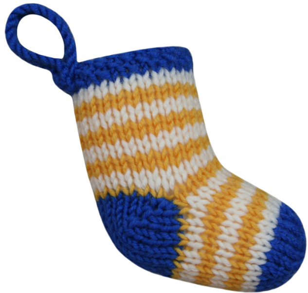
Height approximately 11cm

Join the side edges of the stocking, working up from the gathered toe. Stuff the stocking and attach the hanging loop.