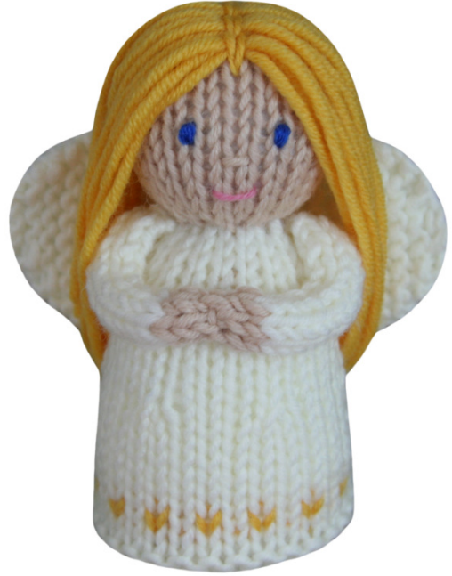
Height approximately 10cm

Join the side edges of the head, working down from the gathered top. To make the head, work a gathering thread through every stitch on the shape head row, draw up and stuff head. Sew the top edges of the arms to body sides, then bring hands together in a praying pose and catch together with a few stitches. Sew on the wings.