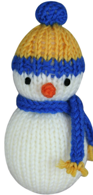
Height approximately 11cm

Join the side edges of the head, working down from the gathered top of the head. To make the head, work a gathering thread through every stitch on Row 26 , draw up and stuff head. Work a gathering thread through the cast on stitches and draw up. Then working up from the base, join the side seam, leaving a 3cm opening. Stuff the body firmly, shaping as you go, then close the seam.