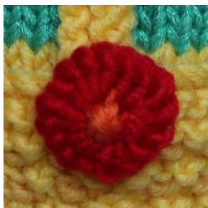
Flowers ( make two )

With flower coloured yarn cast on 18 sts. Break the yarn and thread the yarn through the stitches on the needle, draw up tightly and fasten off. Using the cast on tail-end of the yarn, catch the rows ends together to make a flower shape. Using yarn in a contrast colour embroider a small circle for the centre of the flower. Sew the flowers onto the sides of the basket.